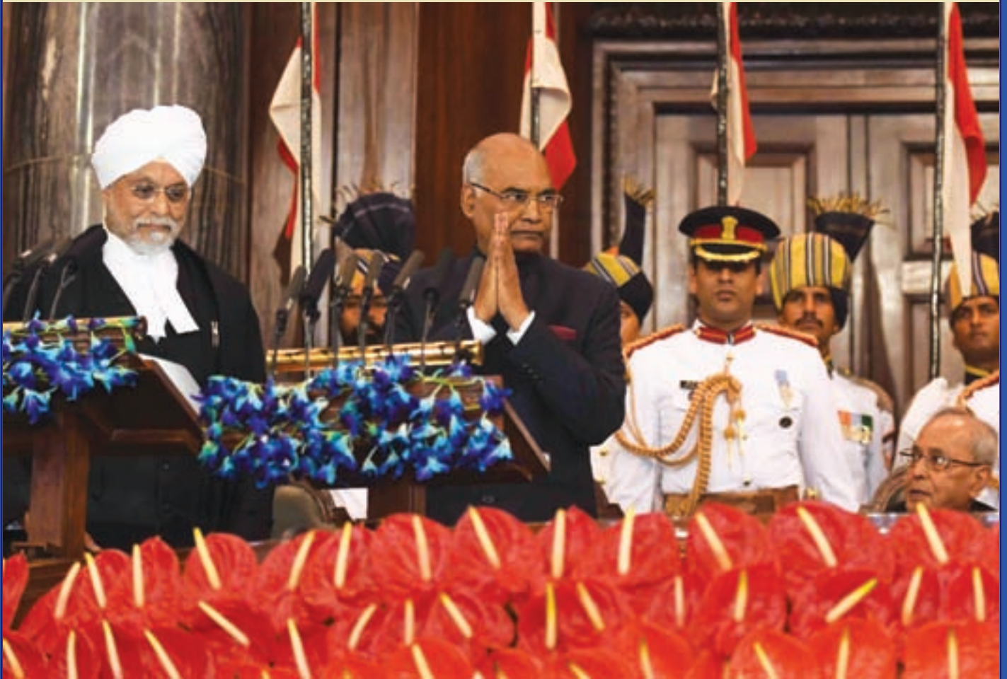
Mr. Ram Nath Kovind sworn in as the 14th President of India by Justice JS Khehar (the Chief Justice of India) at a special ceremony in the Central Hall of Parliament in New Delhi on July 25th, 2017.

"Our Independence was the result of efforts by thousands of patriotic freedom fighters led by Mahatma Gandhi. Later, Sardar Patel integrated our nation. Principal architect of our Constitution Babasaheb Bhim Rao Ambedkar instilled in us the value of human dignity and of the republican ethic. These leaders did not believe that simply political freedom was enough. For them, it was crucial to also achieve economic and social freedom for millions of our people. We would be completing 70 years of our Independence soon. We are also well into the second decade of the 21st century, a century that so many of us intuitively believe will be an Indian century, guided and shaped by India and its accomplishments. We need to build an India that is an economic leader as well as a moral exemplar. For us, those two touchstones can never be separate. They are and must forever be linked. The key to India's success is its diversity. Our diversity is the core that makes us so unique. In this land we find a mix of states and regions, religions, languages, cultures, lifestyles and much more. We are so different and yet so similar and united." - Mr. Ram Nath Kovind, in his speech after swearing in as the President of India