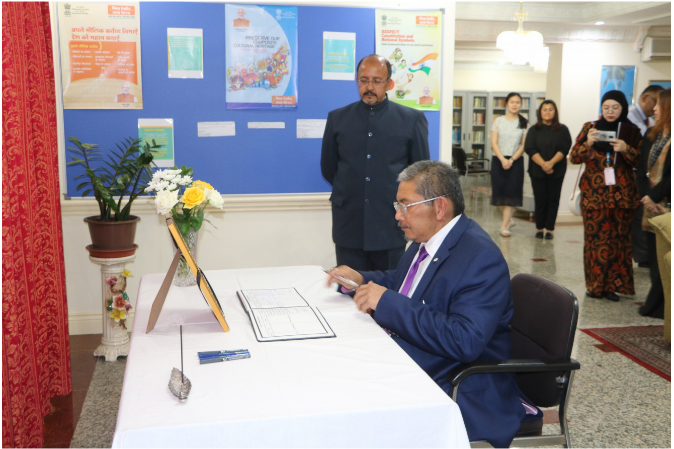
Minister of Foreign Affairs II, Dato Seri Setia Haji Erywan bin Pehin Datu Pekerma Jaya Haji Mohd Yusof signed the condolence book on behalf of the Government of Brunei Darussalam in the High Commission for Late HE Shri Pranab Mukherjee, former President of India.