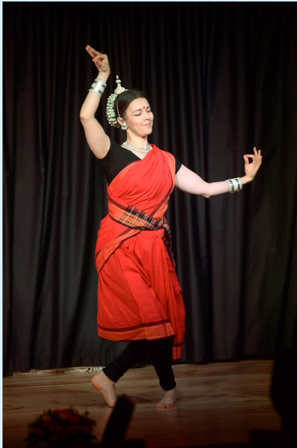
A scintillating fusion of classical Kathak and Flamenco from Spain was presented that truly mesmerised the audience.