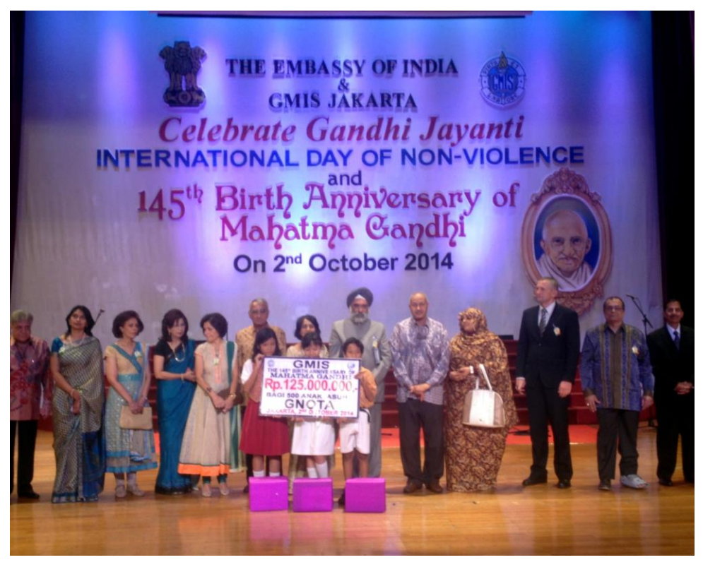
Charity donation to Yayasan Lembaga GNOTA for education of 500 children