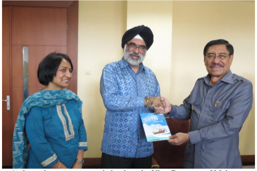
Ambassador present a comic book to the Vice Governor of Makassar