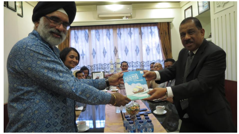
Ambassador present a comic book to the Mayor of Makassar