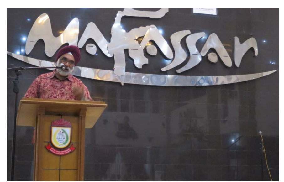
Ambassador speaking on the event