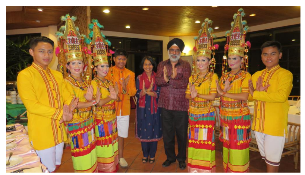
With local performers of Toraja