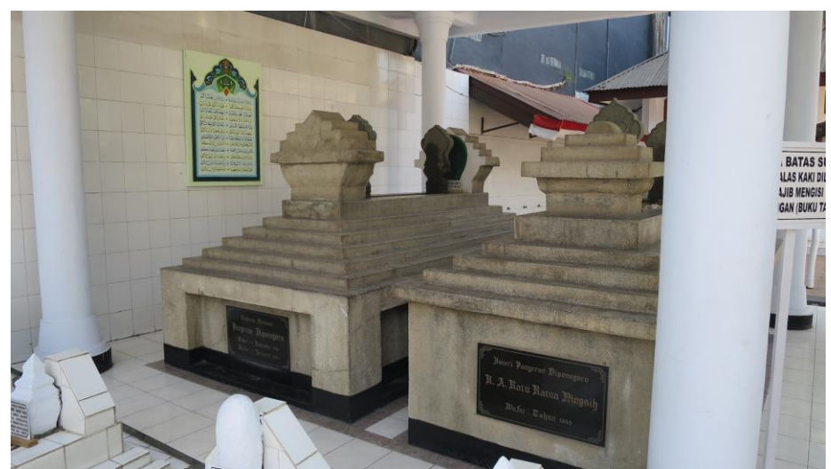
Ambassador pay homage at Pangeran Diponegoro's grave