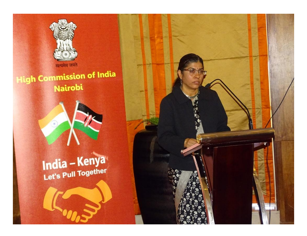
High Commissioner H.E. Ms. Suchitra Durai delivers the welcome address during the business symposium "Enhancing India-Kenya Bilateral Trade and Investment" in Nairobi.