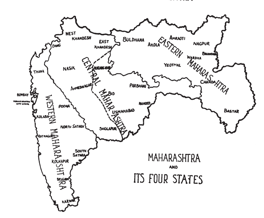
DIVISION OF MAHARASHTRA