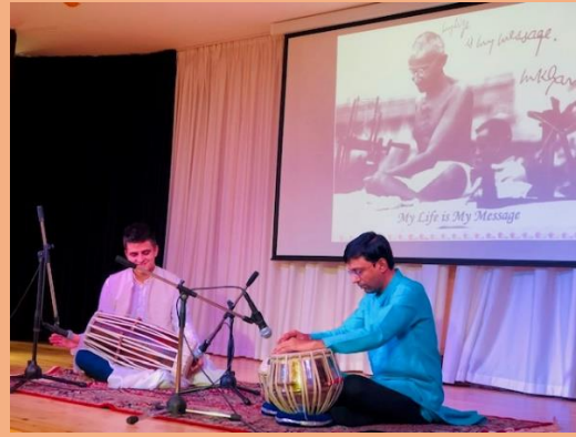
Jugalbandi of table & Pakhawaj by a young Hungarian artist