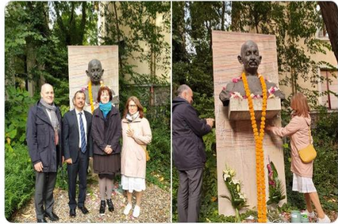
8:58 PM · Oct 6, 2019 · Twitter for Android