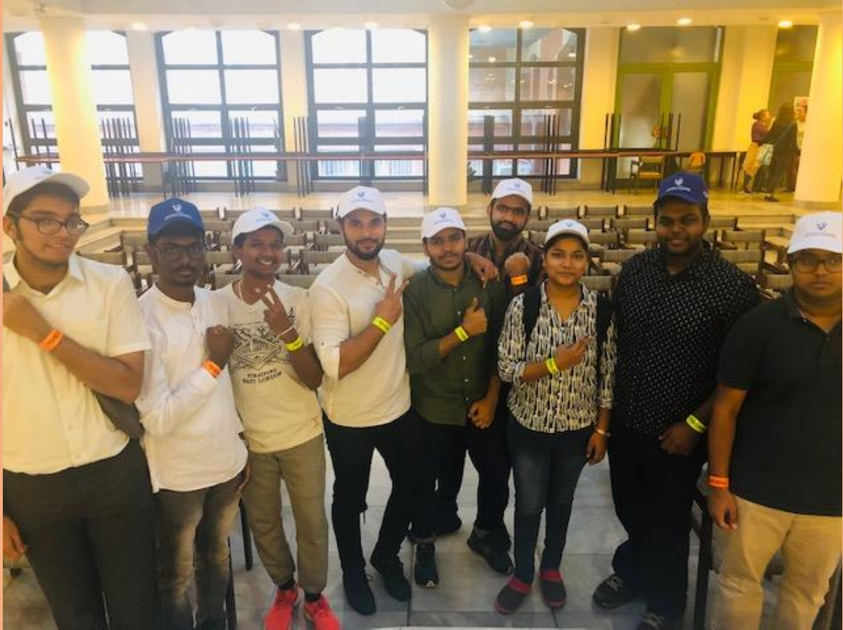
Indian students at Pecs University wearing Gandhi bands & caps