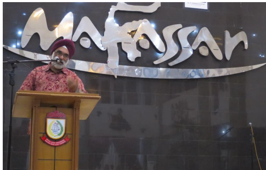
Ambassador speaking on the event