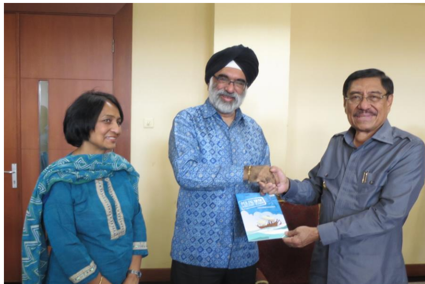
Ambassador present a comic book to the Vice Governor of Makassar