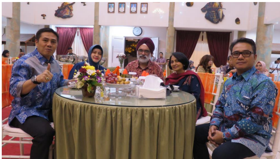
Special dinner hosted by the First lady of Makassar