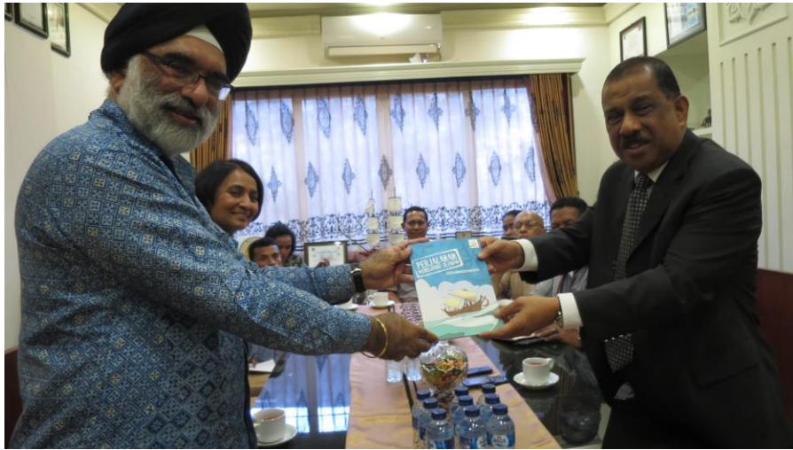
Ambassador present a comic book to the Mayor of Makassar