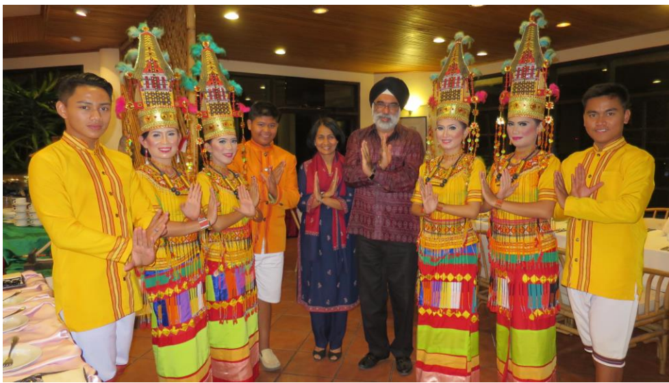
With local performers of Toraja