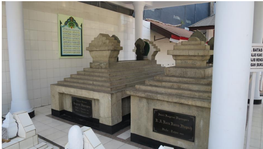
Ambassador pay homage at Pangeran Diponegoro's grave