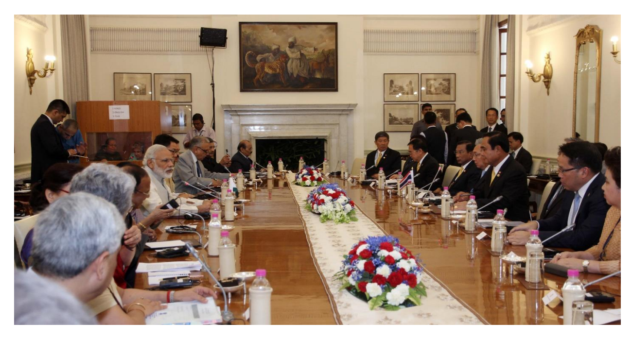
Prime Minister and Prime Minister of the Kingdom of Thailand His Excellency General Prayut Chan-o-cha, at the delegation level talks