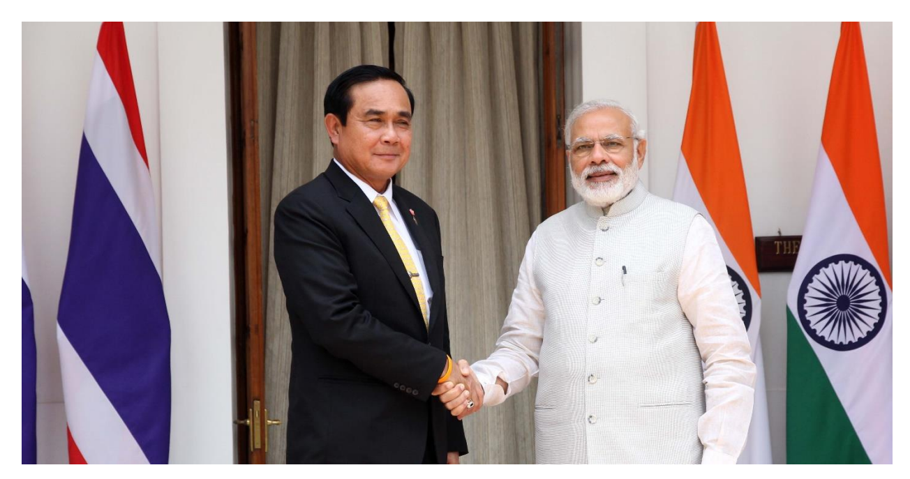
Prime Minister meeting the Prime Minister of the Kingdom of Thailand, His Excellency General Prayut Chan-o-cha

The Thai PM visited Bodhgaya on 18 June.