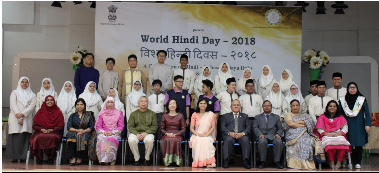
Brunei Darussalam 09 March 2018