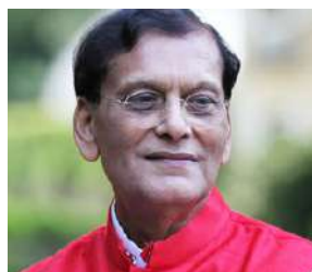
Dr. Bindeshwar Pathak Founder Sulabh International