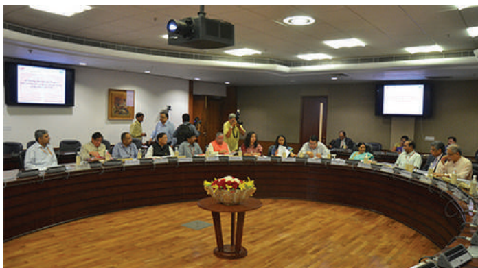
IDF-OI Fourth Board Meeting 23 May 2015

The Fourth Meeting of the Board of Trustees of IDF-OI held in New Delhi on 23 May 2015, was chaired by the Hon'ble Minister, Smt. Sushma Swaraj. In this meeting, the Board revised the mandate of IDF-OI to promote among the Overseas Indians, the flagship programmes of Government of India- Swachh Bharat Mission, Namami Gange, and social and development projects identified by the State Governments.