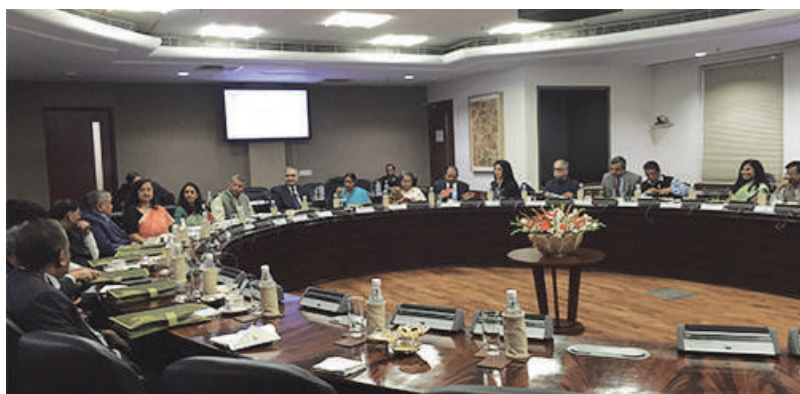
IDF-OI Fifth Board Meeting 05 December 2015

The Fifth Meeting of the Board of Trustees of IDF-OI was chaired by the Hon'ble Minister, Smt. Sushma Swaraj on 05 December 2015 in New Delhi, in her capacity as Chairperson. The Board reviewed the progress made by IDF-OI on the revised mandate for promoting Government of India's flagship programmes- Swachh Bharat Mission and Namami Gange; and projects identified by State Governments.