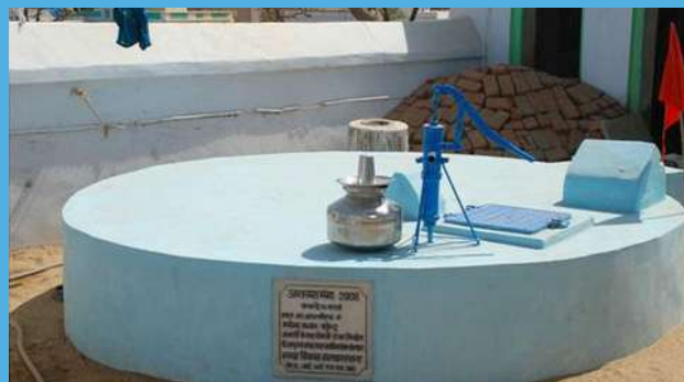
Rainwater harvesting system specifically developed in Raila Village in Rajasthan to assist villages that have insufficient access to clean water.