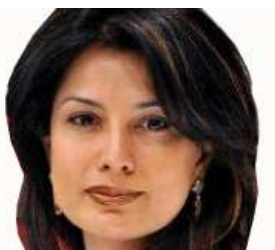
Smt Ritu Beri Managing Director Ritu Beri Design Pvt. Ltd.