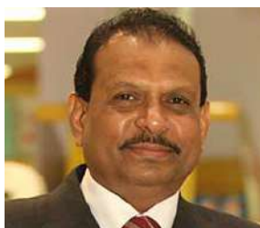
Shri Yusuff Ali M.A. Chairman, LuLu Group International UAE