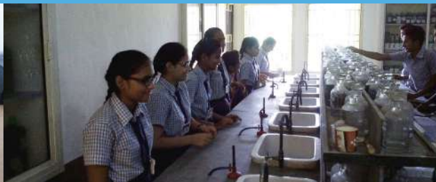
Computer Lab and Chemistry Lab set up in Shri Swaminarayan High School, in Shakarpur Village, Gujarat