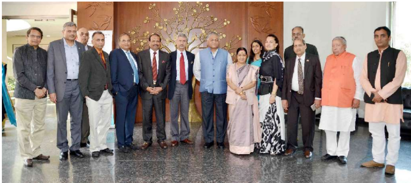
Participants with Hon'ble External Affairs Minister, Smt. Sushma Swaraj and Minister of State for External Affairs, Gen. V.K. Singh (retd.) at Pravasi Bharatiya Divas 2016, Panel Discussion-I in New Delhi, 27 February 2016

'India Development Foundation of Overseas Indians: Diaspora Contributing to India's Social and Development Efforts'