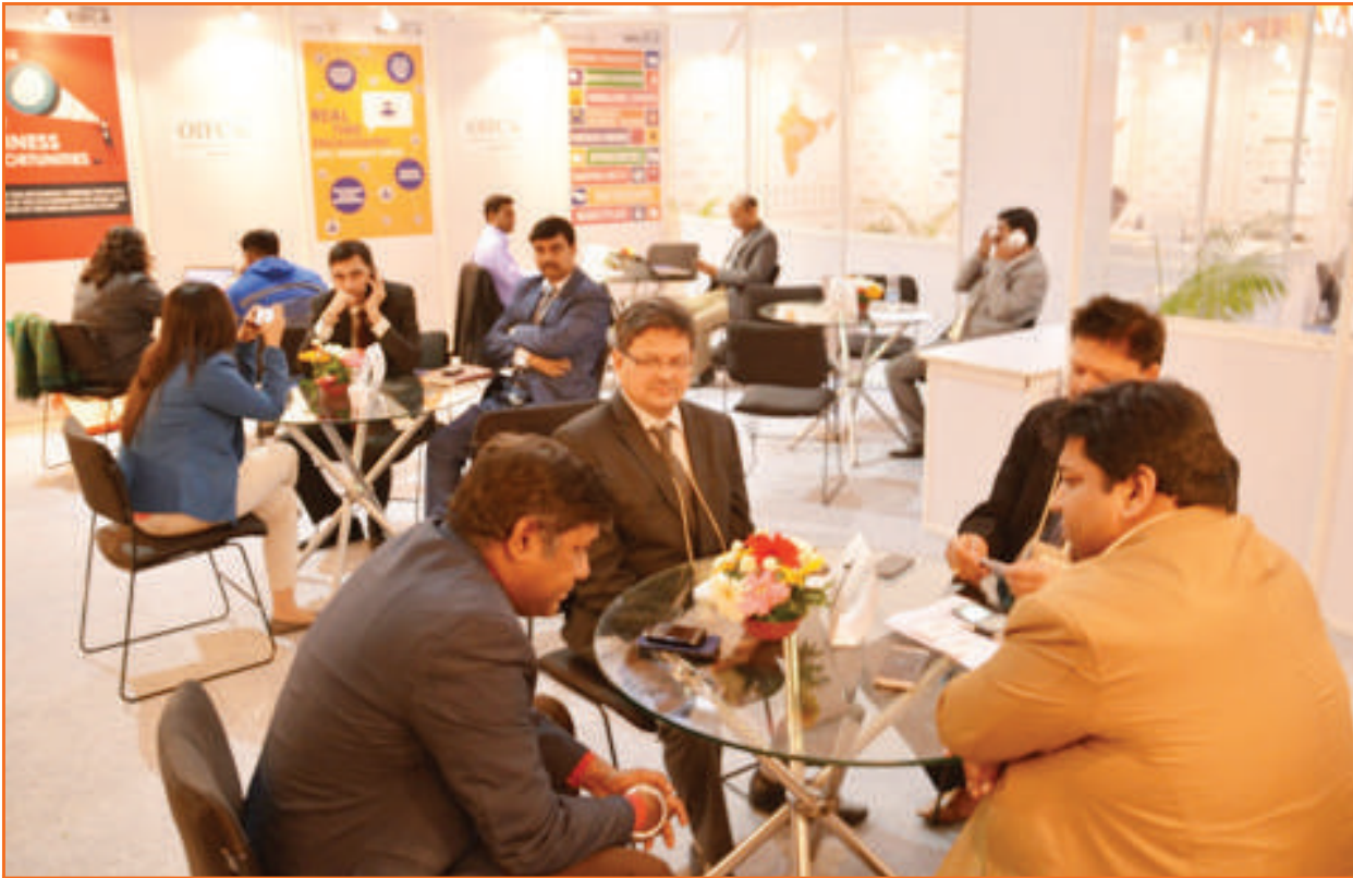
Pre-Scheduled online b2b meeting at OIFC Market Place