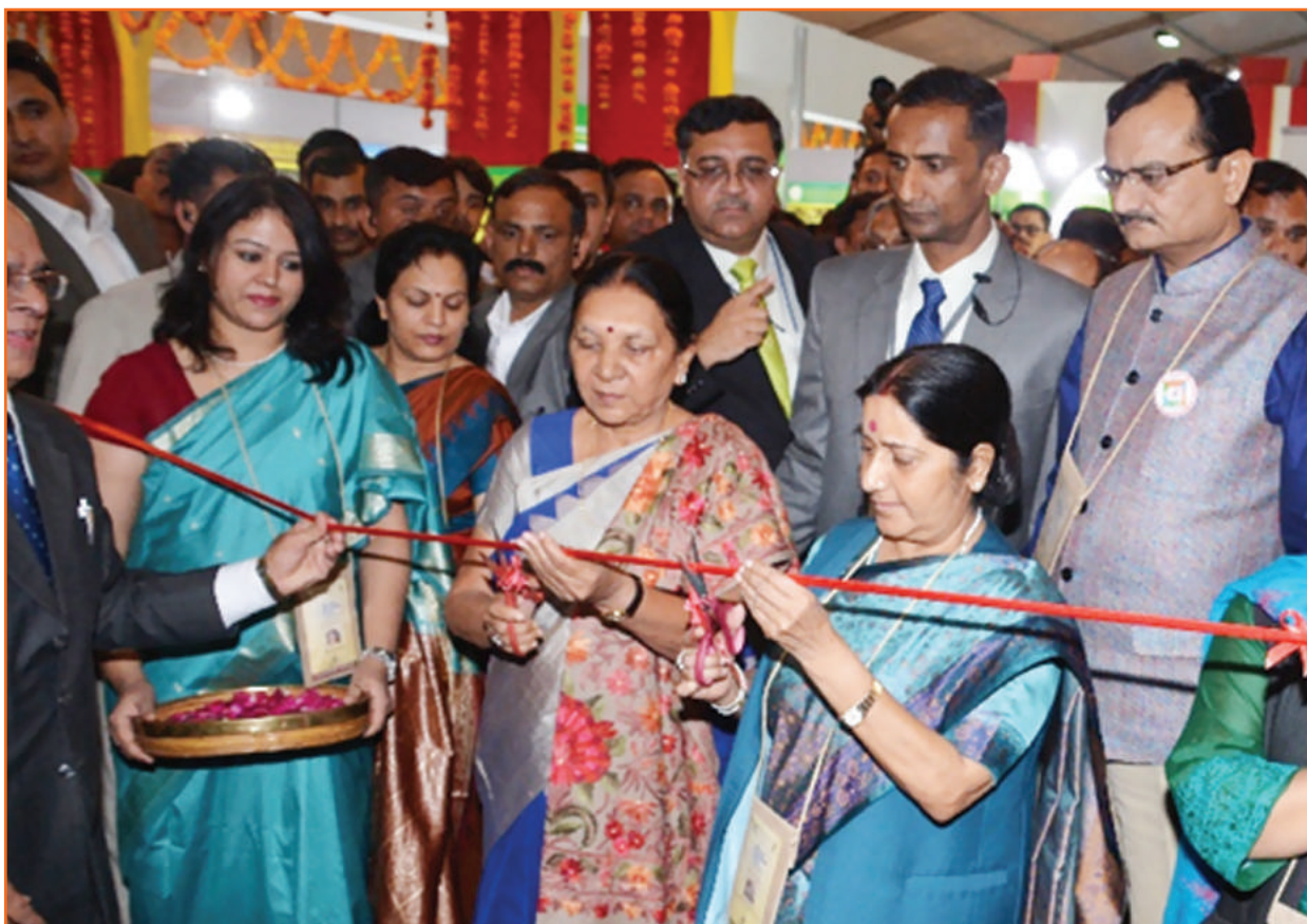
Hon'ble Minister of Overseas Indian Affairs, Smt Sushma Swaraj and Hon'ble Chief Minister of Gujarat, Smt Anandiben Patel inaugurating the 9th OIFC Market Place @ PBD 2015

Inaugurated by Hon'ble Minister of Overseas Indian Affairs Smt. Sushma Swaraj and Hon'ble Chief Minister of Gujarat, Smt. Anandiben Patel, the OIFC Market Place offered a unique platform to facilitate a pre investment business dialogue between overseas Indians and Indian companies.