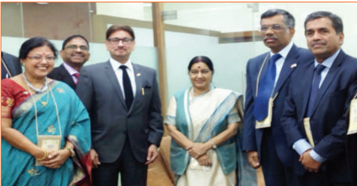
Bahrain delegation called upon Hon'ble Minister of Overseas Indian Affairs.

The business delegation from Bahrain India Society (BIS), facilitated by OIFC, called upon Smt Sushma Swaraj, Hon'ble Minister of Overseas Indian Affairs. The delegation complimented the Minister (MOIA) on the organization of a different PBD and the keenness of the new Government to engage with Pravasis.