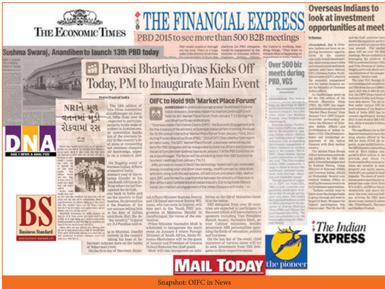
Snapshot: OIFC in News

Over 150 exposures across print and online editions were secured.