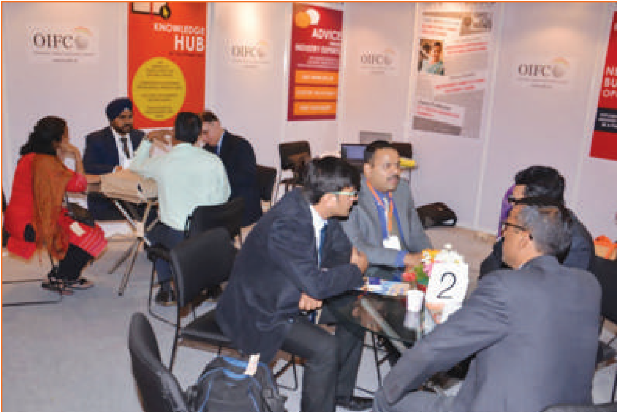
Pre-Scheduled online b2b Meeting at OIFC Market Place