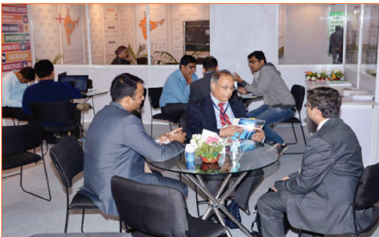
PBD delegates meeting with OIFC Staff

OIFC was also approached by a number of companies who wanted to explore being partner of OIFC. List of meetings are given in Annexure III.