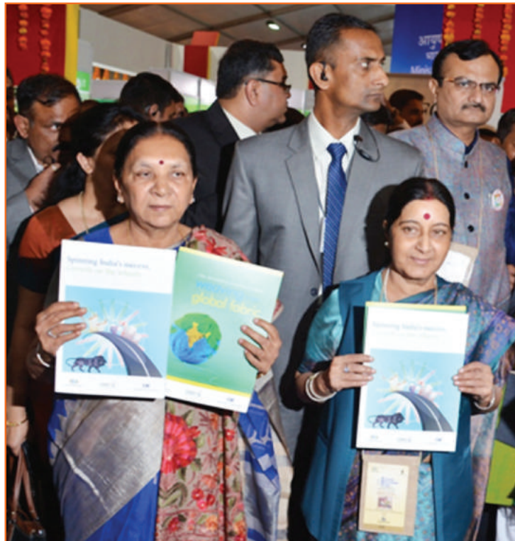
Hon'ble Minister of Overseas Indian Affairs, Smt Sushma Swaraj and Hon'ble Chief Minister of Gujarat, Smt Anandiben Patel released the two OIFC publications

Continuing its endeavour to be a knowledge hub for Overseas Indians, OIFC brought out two publications which were released by the Hon'ble Minister of Overseas Indian Affairs, Smt Sushma Swaraj and Hon'ble Chief Minister of Gujarat, Smt Anandiben Patel during PBD 2015.