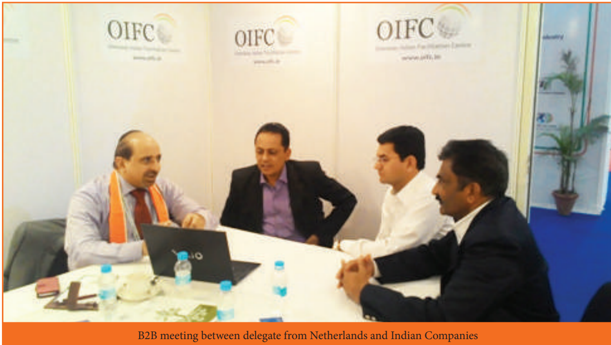
B2B meeting between delegate from Netherlands and Indian Companies

The potential inflow of forex into India through business from these projects is Rs 311.5 crore of which Rs 165 crore could be investment and the balance Rs. 146.5 crore is value of expected sourcing from India