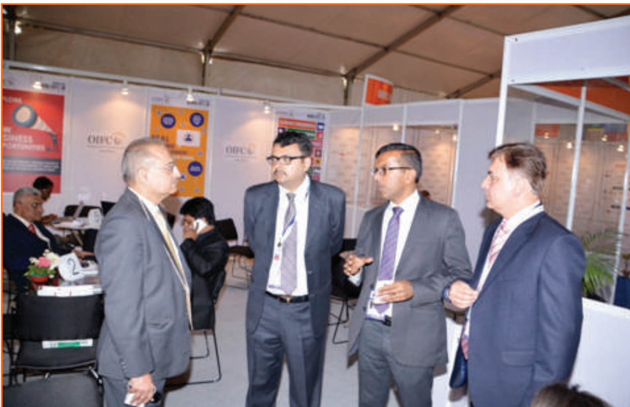
Pre-Scheduled online b2b Meeting at OIFC Market Place